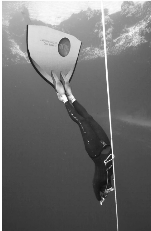
Figure 1. Sara Campbell sets a new world record of 96 m in constant weight deep diving.