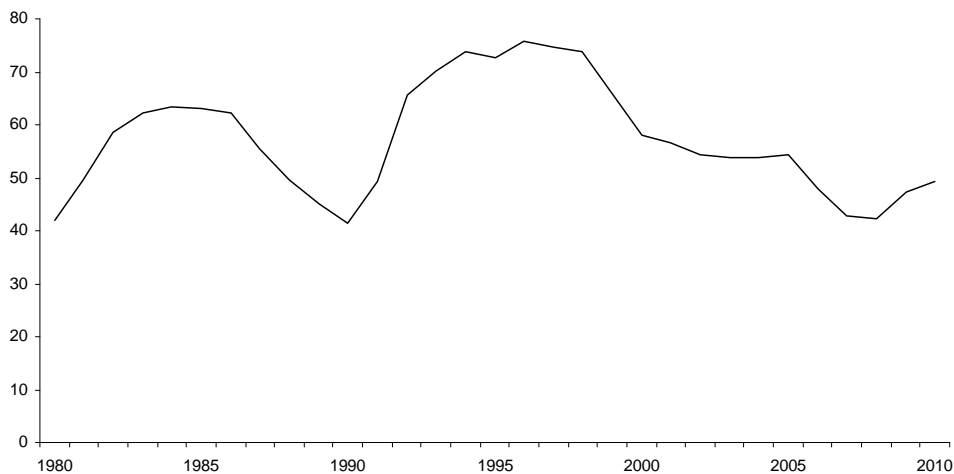
Figure 2. Gross general government debt in Sweden, per cent of GDP